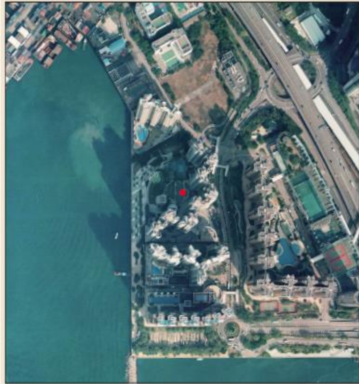
● Location of the Development 發展項目的位置